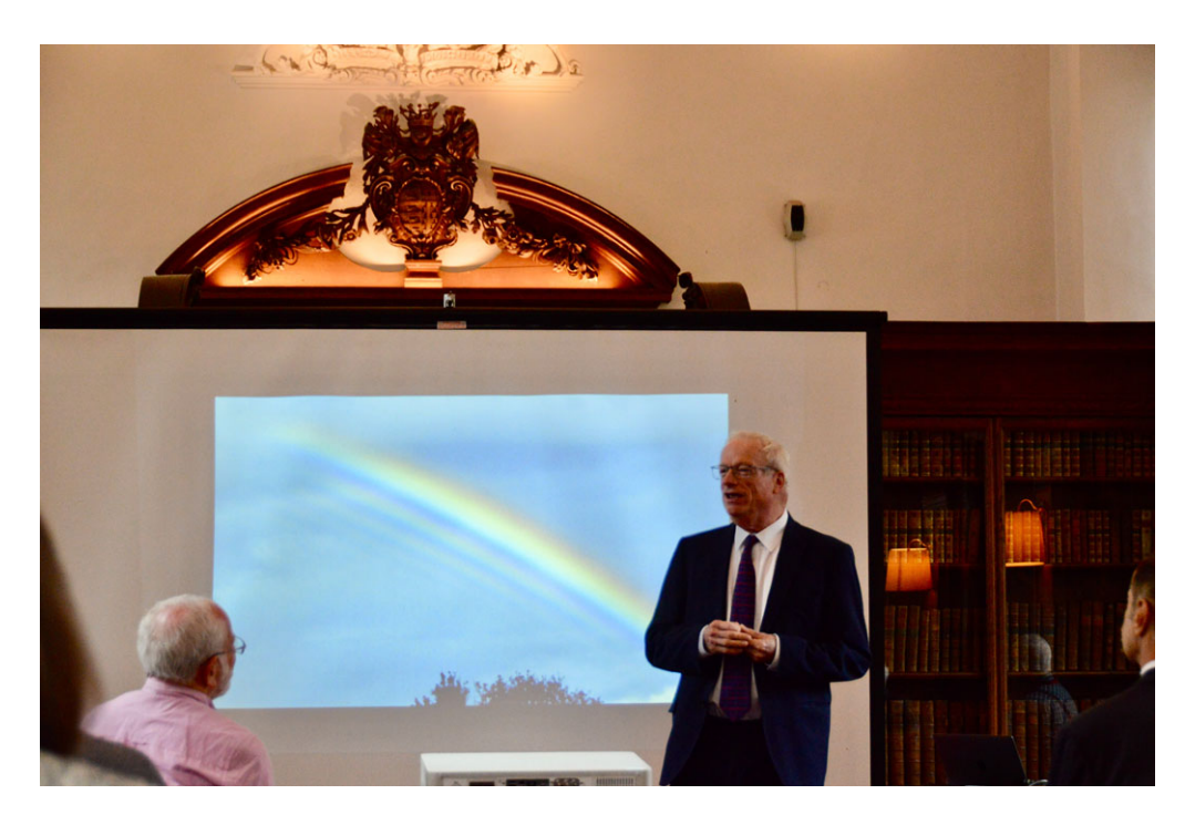
Figure 1. The Stokes<sup>200</sup> Symposium opens in the Old Library of Pembroke College. One of us (HEH) looks on as the Master of Pembroke welcomes participants to the college. (Online version in colour.)

royalsocietypublishing.org/journal/rsta Phil. Trans. R. Soc. A 378 : 20200160